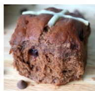
Chocolate Bun $1.00