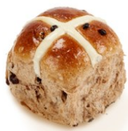
Fruit Bun $1.00