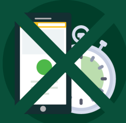
No screens 1 hour before bed