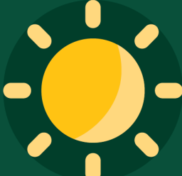
Have a break after 1 hour of play