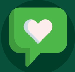
Only message and talk online with people you know in real life