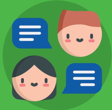
Healthy families chat about online experiences