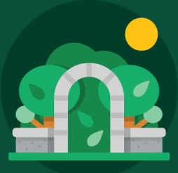
Balance screen time with green time